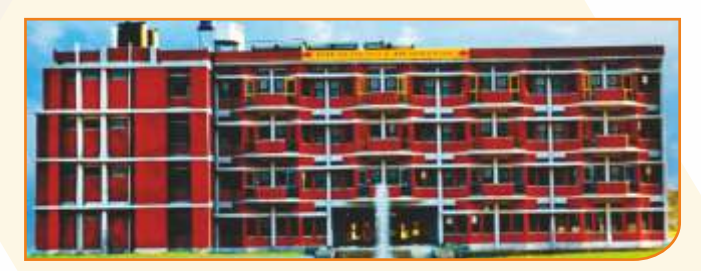
Bhagwant Hospital, Bhawantpuram, Mzn. (U.P.)