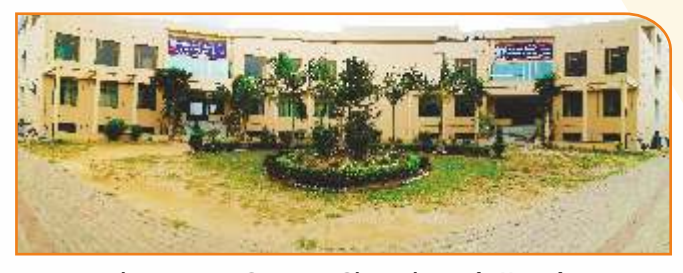
Bhagwant Group, Chandpur (Bijnor)