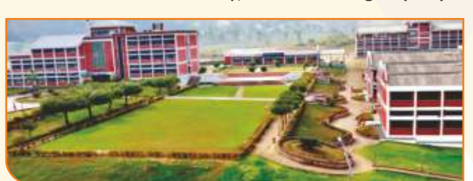
Bhagwant Institute of Technology, Mzn. (U.P.)